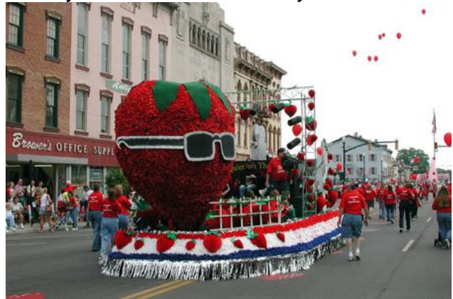
Troy's annual Strawberry Festival attracts upwards of 200,000 people each year.

Transportation continues to keep Troy growing as evidenced by Interstate 75 which traverses through Troy, with four interchanges serving the community. Ten miles south, I-75 intersects with I-70 at the "Crossroads of America", providing unparalleled north-south and east-west vehicular access. Troy also is served by rail, and is 10 miles from the Dayton International Airport.