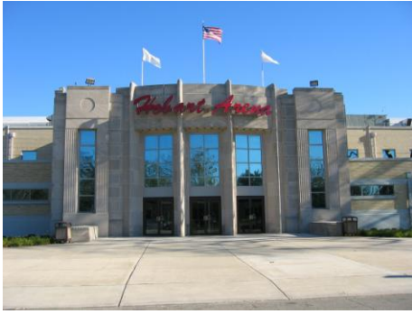
The Hobart arena seats 5,000 for basketball and hockey.